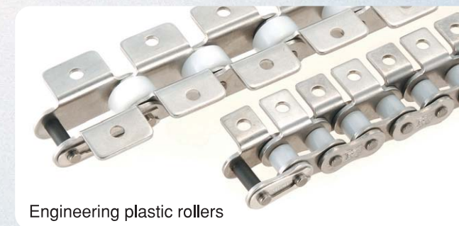
Engineering plastic rollers