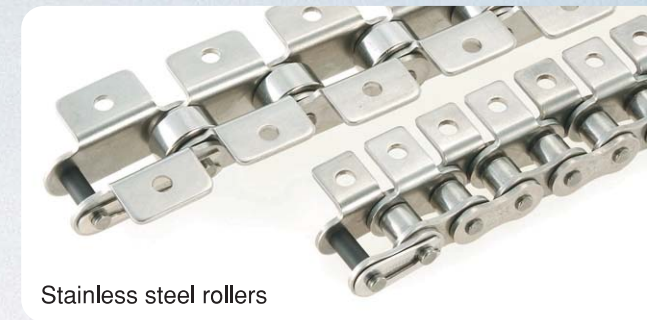
Stainless steel rollers

The LSC Series Chain with stainless steel rollers provides over four times the wear life compared to SS Series Stainless Steel Chain. Meanwhile, the increased wear resistance of the engineering plastic rollers (white) gives them over ten times the conventional wear life.